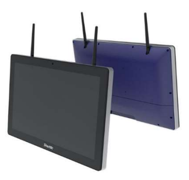
External WLAN antennas upon reqest

Upon request on a project-related basis, the Shuttle Panel PC P21WL01-I3 can be ordered with external WLAN antennas or other connections (e.g. DisplayPort, additional USB ports or a second HDMI port).